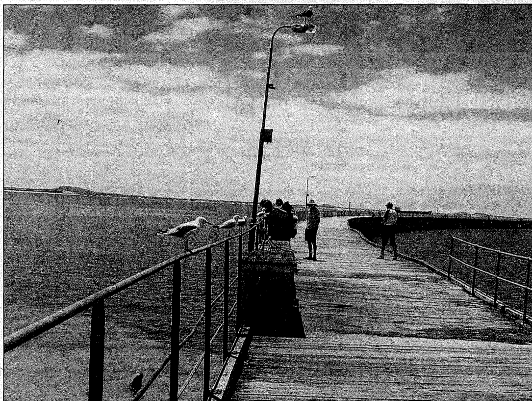
Beloved landmark: The Esperance Tanker Jetty.