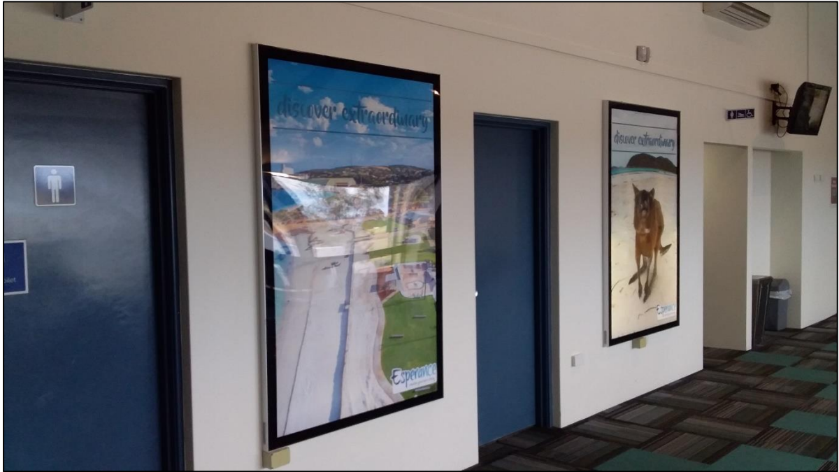
Figure 3: Signage locations 6 and 7, non-cycling rear illuminated fixed advertisements measuring approximately 1200 x 1800mm (1120 x 1710mm internal) each. Rear illuminated 'light box' signs need to be printed in standard light box GSM backlit polypropylene.

Questions or queries? Contact our Airport Operations Coordinator at: