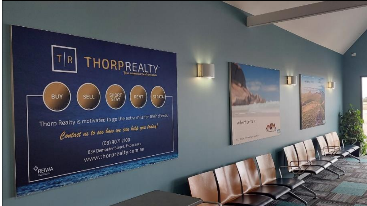
Figure 2: Fixed stretched fabric 1200 x 1800mm signs, locations 1 and 10 to 13. Location 1 (not shown) is portrait orientation, 10 to 13 (10 to 12 shown above) are all landscape.

2.16m 2 1200 x 1800mm @ $637.20 incl. GST per year*