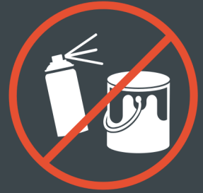
Paint, aerosols & chemicals