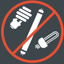
Household light globes and tubes

This waste is hazardous to the environment and should NOT be placed in any of your bins! This includes items such as (but not limited to):