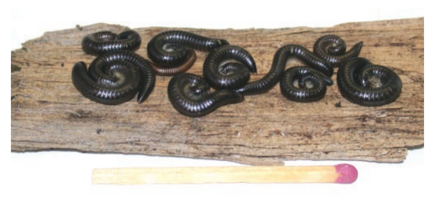
Figure 2. Adult millipedes to scale using a standard match.

After the first year of life, juveniles have reached the seventh, eighth or ninth stage of development and will be about 1.5 cm long. After this stage they will moult only in spring and summer. Portuguese millipedes usually mature after two years when they are in the tenth or eleventh stage of growth and some can live for more than two years.