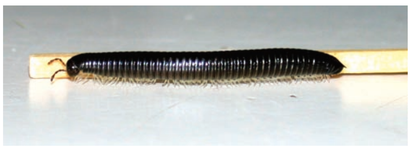
Figure 3. Uncoiled millipede in motion.